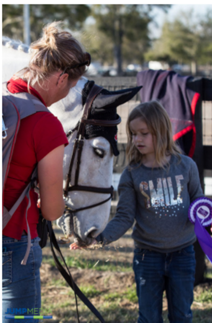
Coup de Chance meets young fans

Zilver springs may have a new rider in his four-legged friend Louise!